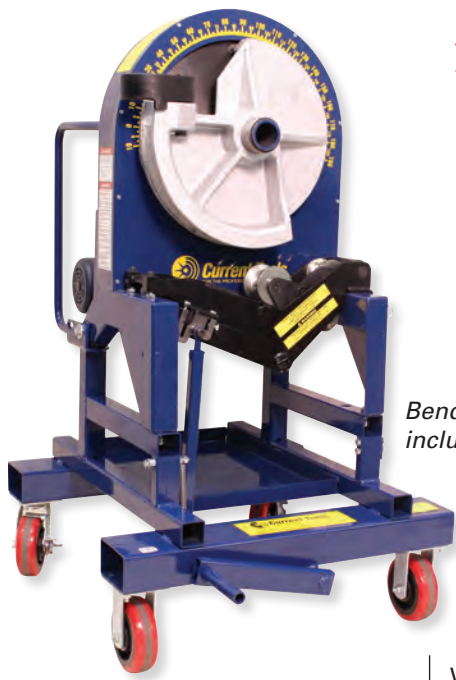
Bender not included.