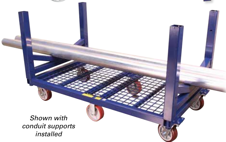
Shown with conduit supports installed