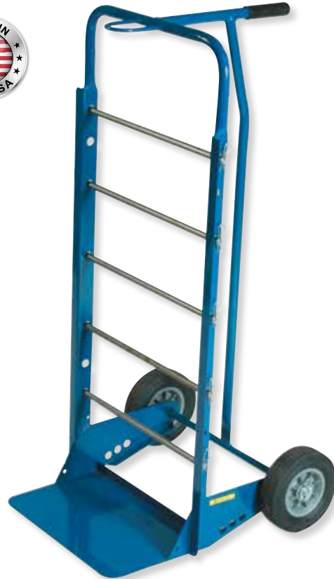
MODEL 510 Reel Truck