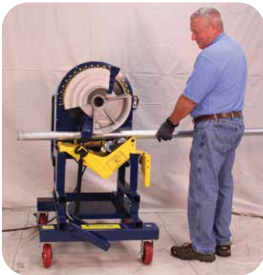
Load and unload conduit at a safe, ergonomic height