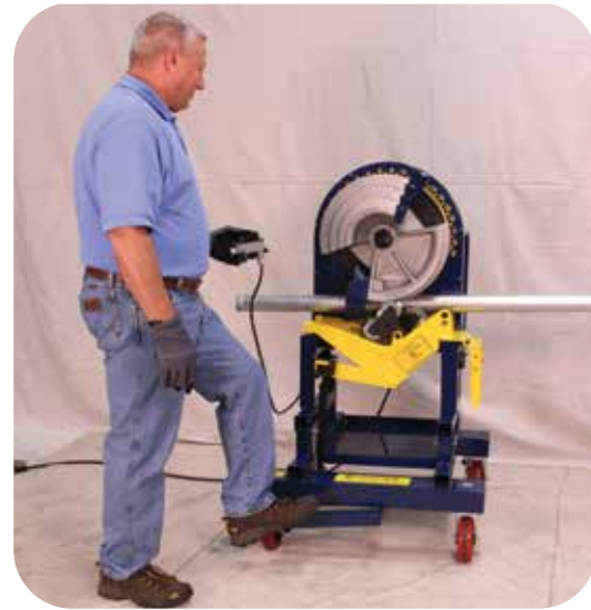
All operations are located at a comfortable position to minimize worker fatigue.