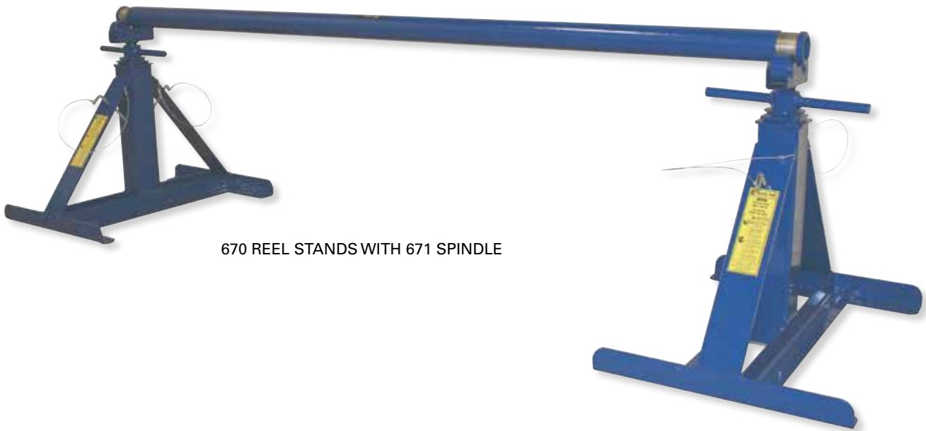
670 REEL STANDS WITH 671 SPINDLE